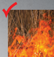
Improved BAL rating