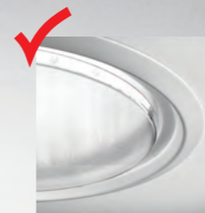
New look Edge Glow