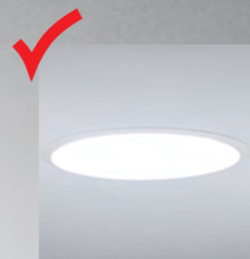
Easier to clean