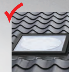
Easier to install